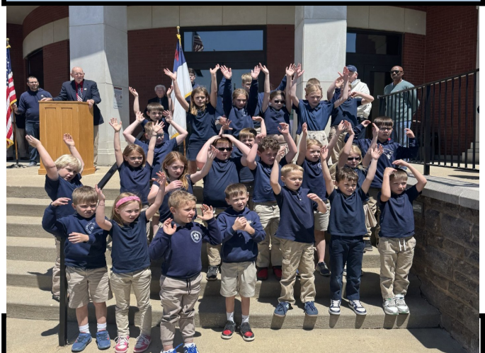
St. Paul school kids at the court house for the national day of prayer.

Memorial Day Rosary will be held at the Leitchfield Veterans Memorial Park on Memorial day May 25th at 10am! Come out & join us as we pray for those that made the ultimate sacrifice for our country.