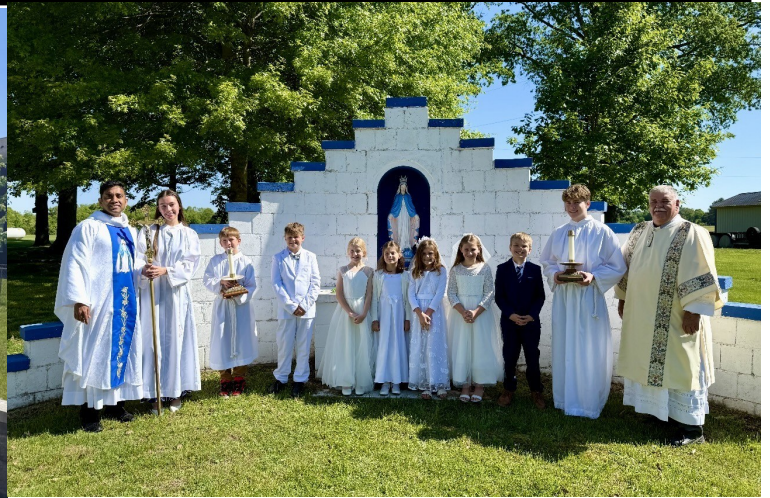
Images from Mary Crowning at Both Parishes last week